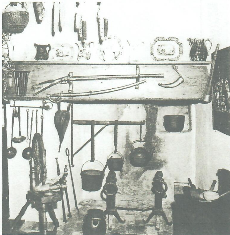
The fireplace which served the original kitchen-living room is complemented with all manner of cooking utensils used in Colonial days.