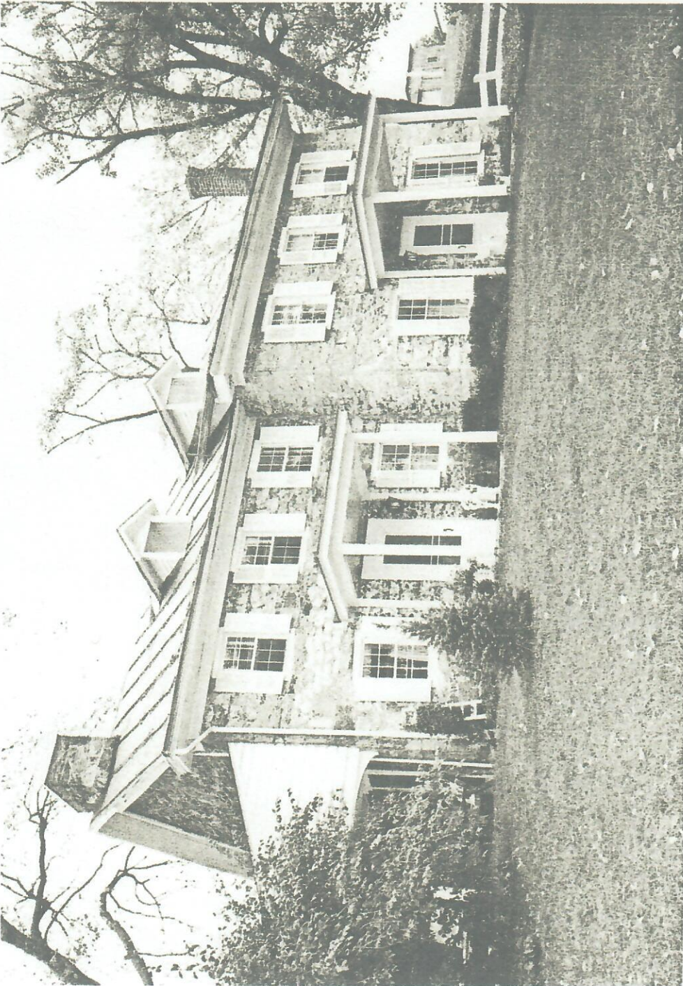
House of Many Stairs.

action "The over- it for der to nitals by the re re- zing t was lattic rably ssage- ouse, heads t evil could- in its ed in pand- e may and in