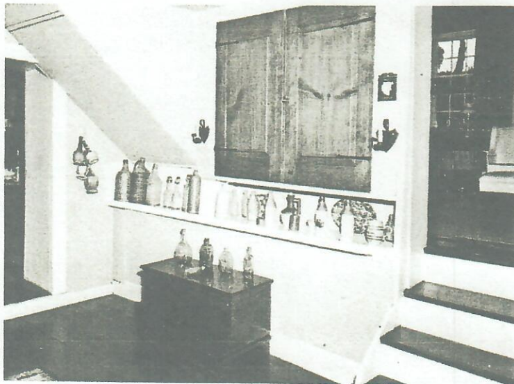
Reminiscent of the days when this room was part of Bull's Head Tavern is the bar with its collection of antique bottles. Note the three feet wide pine floorboards and the stairs leading into the second level as well as the enclosed section of another set of stairs.