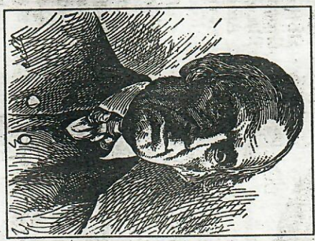
Levi Coffin (1789-1877) of Fountain City, Ind., was a Quaker. Many members of this group worked against slavery.

Levi Coffin and his wife helped hundreds of slaves escape. He was very proud of the fact that not one of those he helped was recaptured. He was often called the "president of the Underground Railroad."