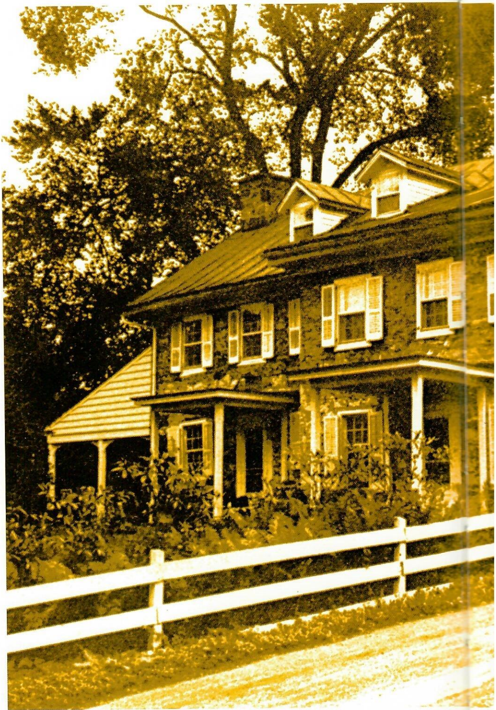
The House of Many Stairs